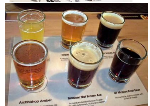
A flight of Water Street beers

Next year I hope to attend and spend more time at a different Water Street Brewery location to see more beer stuff and also see the Delafield Brewhaus, which displays an equally great collection. Maybe my grand kids will want to join for some water-park time as well. We'll see! Its a show worth attending-especially to break those winter blues.